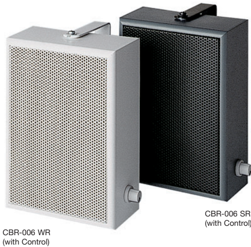
CBR-006 WR (with Control)