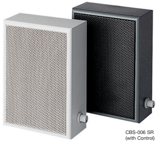
CBS-006 WR (with Control)