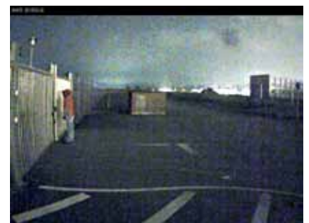
AXIS Q1602/-E Network Cameras