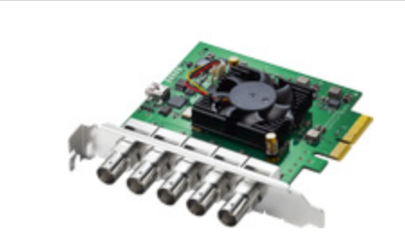
DeckLink Duo 2 PCIe capture and playback card with 4 independent channels for SD and HD up to 1080p60.