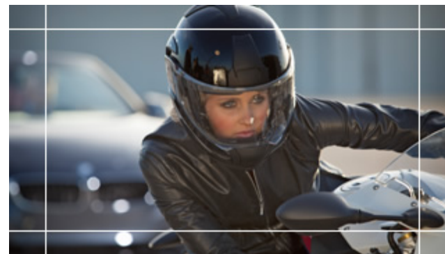
H and V Markers