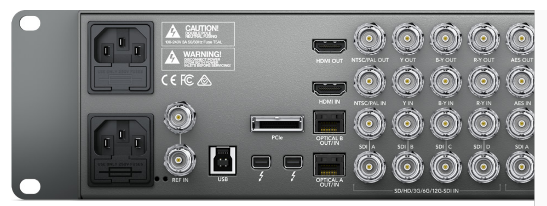
UltraStudio 4K Extreme