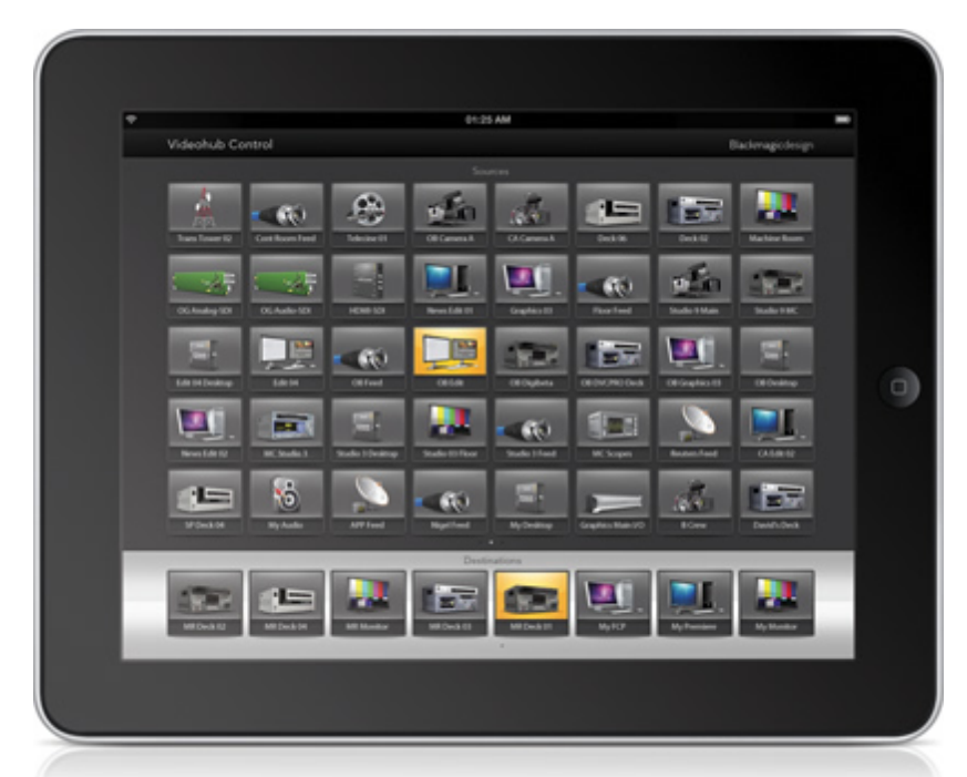
Control your videohub router from your iPad™ with free control panel software!

Now you can control your router from anywhere in your building. Videohub routers use ethernet for the control panel connections so you can select from a wide range of hardware rack mount panels or control your router from your Mac, PC or even iPad! You can even customize your own control solutions using the Videohub developer SDK!