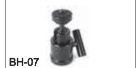
BH-07 Camera ball head for DN-60A