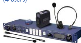
ITC-100 Intercom System