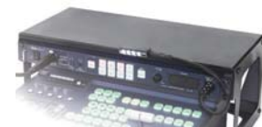
SE-2000 Monitor/Intercom Holder