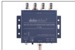
VP-445 Distribution Amplifier