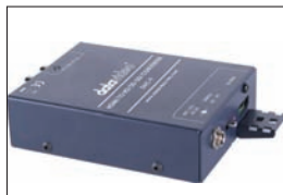
DAC-9 Video Converter