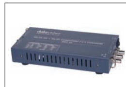
DAC-50 Video Converter