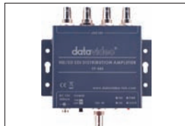
VP-445 Distribution Amplifier