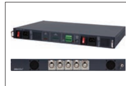
PD-4 Power Distributor

one may use six of the SDI ports and two of the HDMI ports.