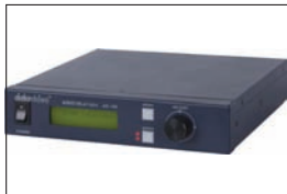
AD-100 Audio Delay