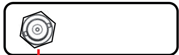
① 1. 3G/HD/SD-SDI Input