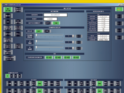
MBP-100CK Set-up Display