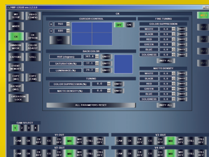
Chroma Key Display