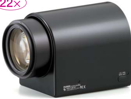
*Photograph is a similar model.