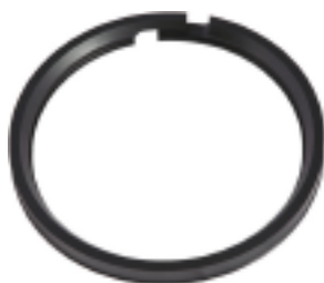
GARD Donut Adaptor Ring