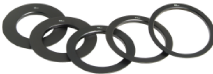
GAR Adaptor Ring (sizes available: 52mm, 58mm, 62mm, 72mm, 77mm, 82mm, 86mm)