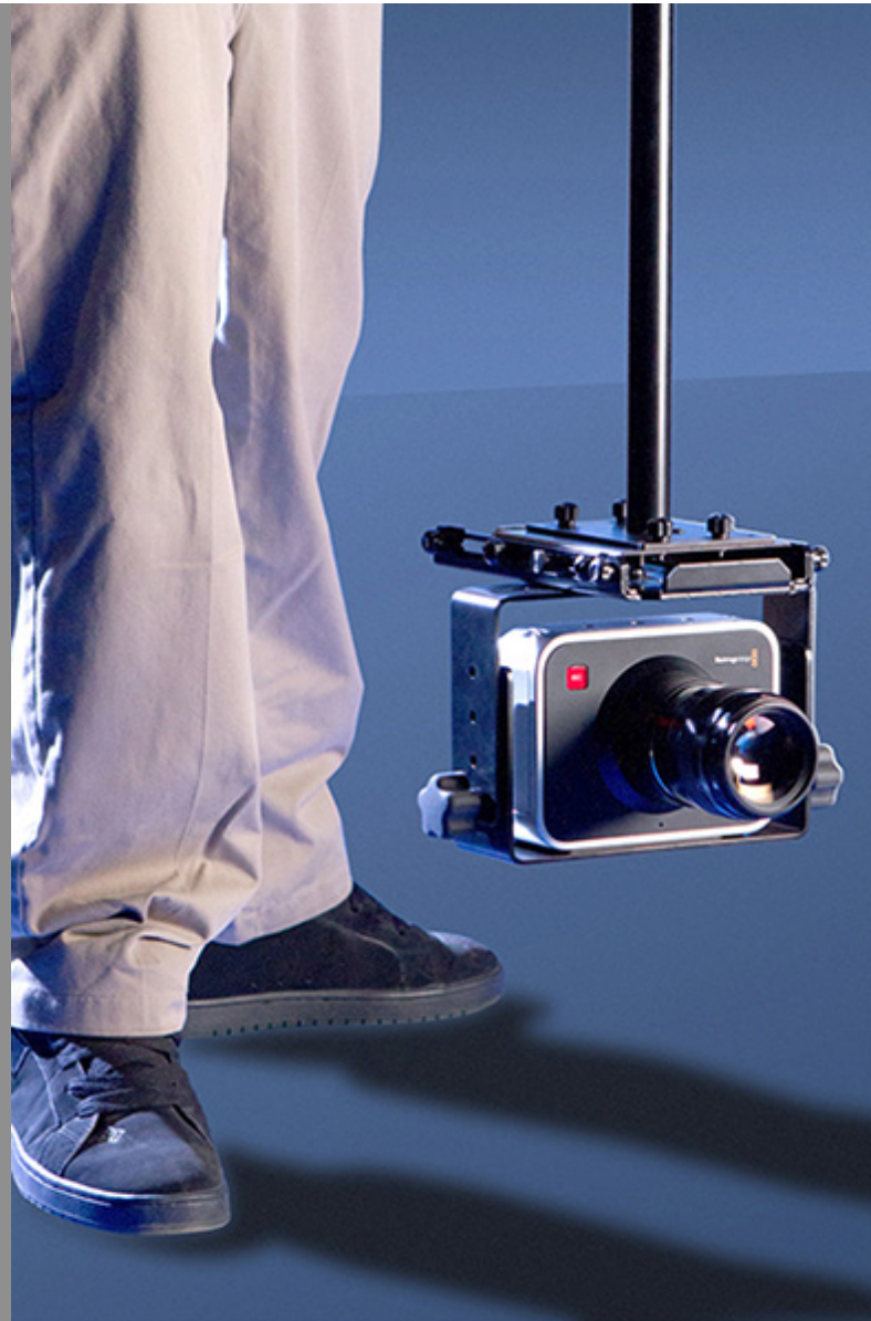
Glidecam DSLR Low Mode Mount in Operation