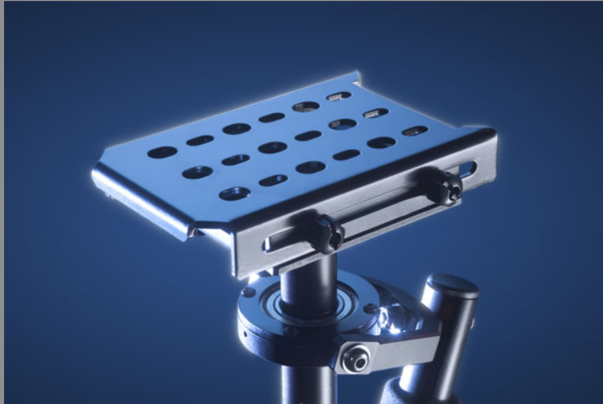
Glidecam XR-PRO - Camera Mounting Platform

Glidecam XR-PRO (Shown with the Sony XDCAM)