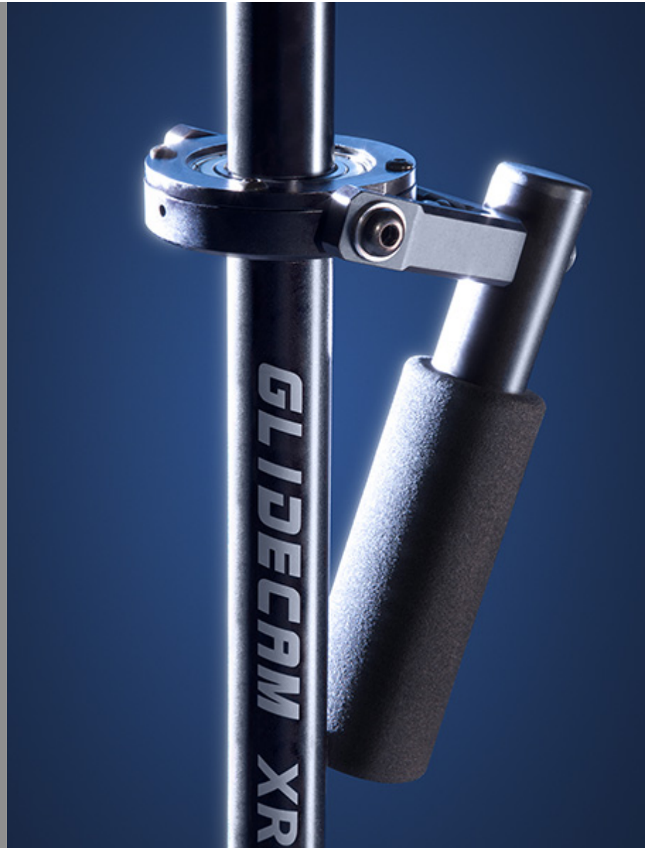
Glidecam XR-PRO Precision, Three-Axis Gimbal and Foam Padded Handle Grip