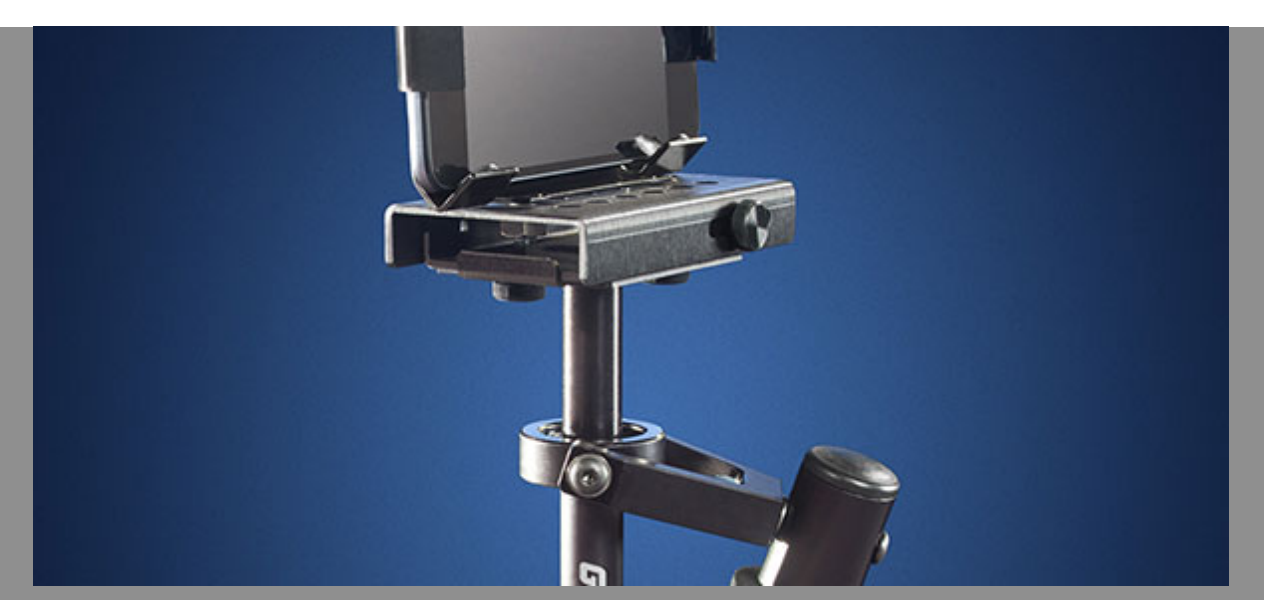
Glidecam iGlide Adapter shown attached to the Camera Plate of a Glidecam iGlide (Back View)