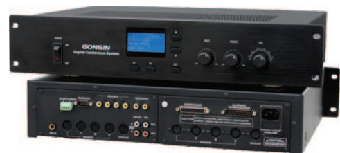
CENTRAL CONTROL UNIT TC-Z3 / TC-ZB3