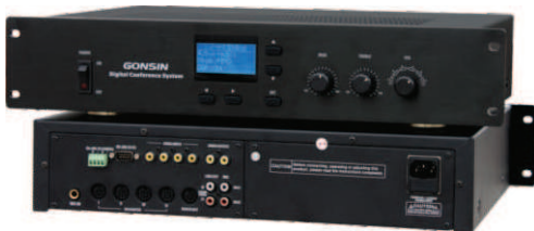
CENTRAL CONTROL UNIT TL-Z3 / TL-ZB3