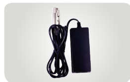
4-pin XLR AC-DC adapter