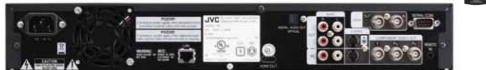
This rear panel photo is SR-HD1700US model.