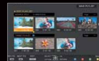
Playlist Edit on-screen display

It is possible to apply Playlist and Cut Edits to titles stored on the internal hard drive, so you can create edited videos that meet your specific needs. You can also create Auto Repeat discs that automatically resume playback from the start for unattended demonstrations.