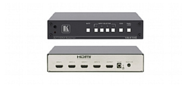
The VS-41HC is a highperformance switcher for HDMI signals. It switches any one of the four inputs to a single output.