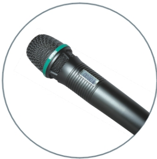
Handheld Transmitter / ACT-707HM

MR-90 is a professional portable wireless receiver for ENG camcorders and video production applications. Designed for lasting performance in abusive conditions, the MR-90 delivers clear reception in even the most challenging locations.