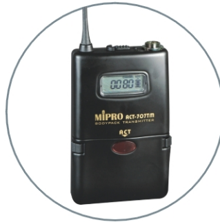
Bodypack Transmitter / ACT-707TM