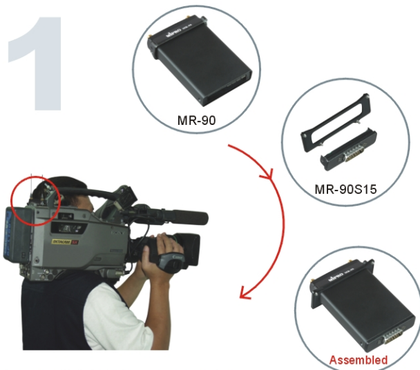
Installed in SONY Betacam camcorder.

For SONY Betacam camcorders with 15-pin I/O sockets. Installs directly into the reserved slot on the camcorder. No need for external power and signal output cable.