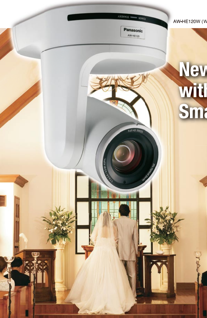
AW-HE120W (White Model)