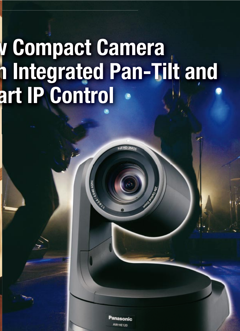
AW-HE120K (Black Model)

1/3 Type Full-HD "U.L.T.*" 3MOS Image Sensors Enable Stable Shooting with High Levels of Sensitivity, S/N and Resolution