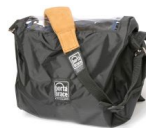
QSA-3 Audio Quick Slick