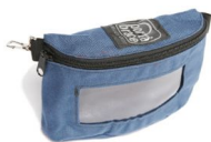
CP CP Pouch