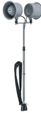
Carrying-Set (without base)