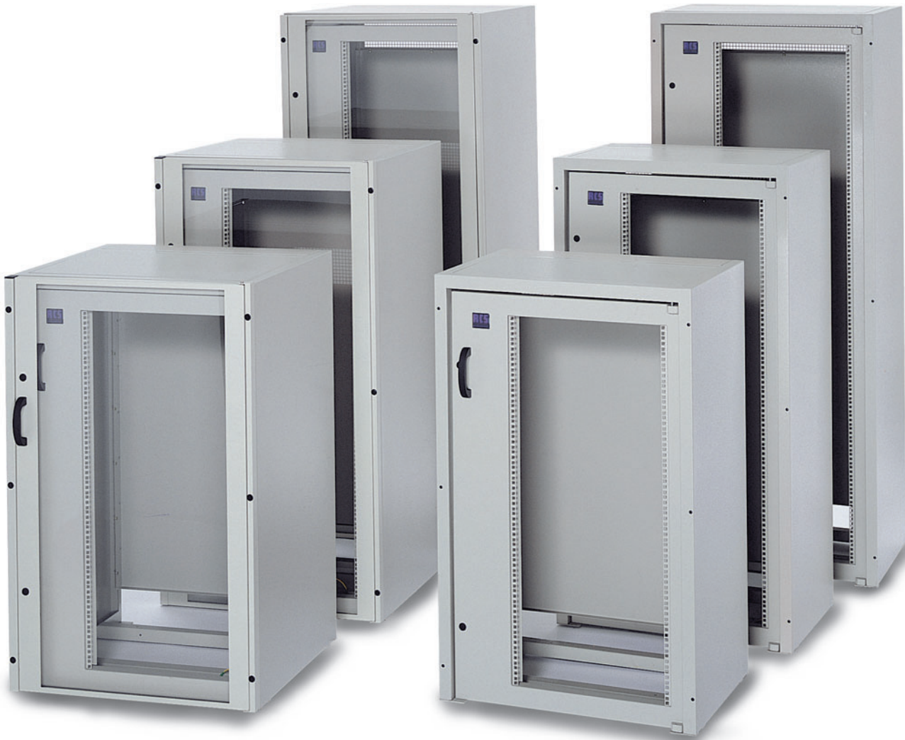
19" swing frame cabinets, depth 550 mm (with plexiglass doors)