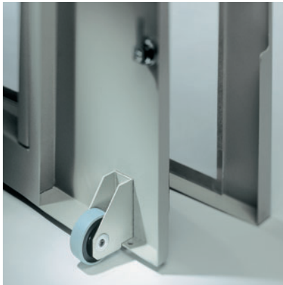
The picture shows the additional castor on 30 and 40 RU swinging rack cabinets.