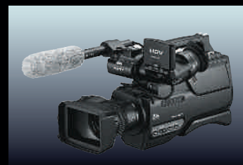
Mounted on HVR-HD1000

Plug-in power is supplied from the microphone input jack of the compatible Sony camcorder. When used with a camcorder that doesn't support plug-in powering, about 900 hours of power is provided by installing a single alkaline AA battery.