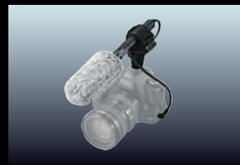
Mounted on DSLR camera