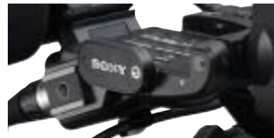
Removable Front Shoe