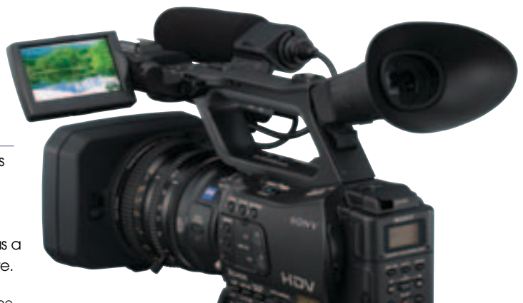
XtraFine LCD and EVF