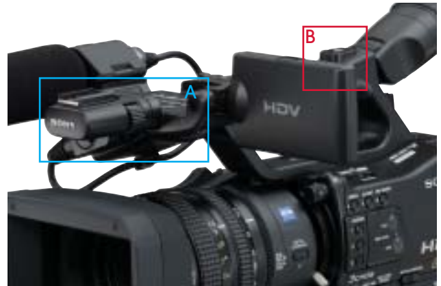
A:Removable Front Shoe B:Screw Hole

The HVR-Z7E features two accessory shoes. There is a cold shoe on the front that can be removed to make room for a mattebox. While at the rear, there is a screw-hole type shoe located on the handle, which can be changed to a cold shoe, if required, using supplied parts.