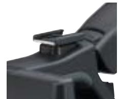
Rear cold shoe parts