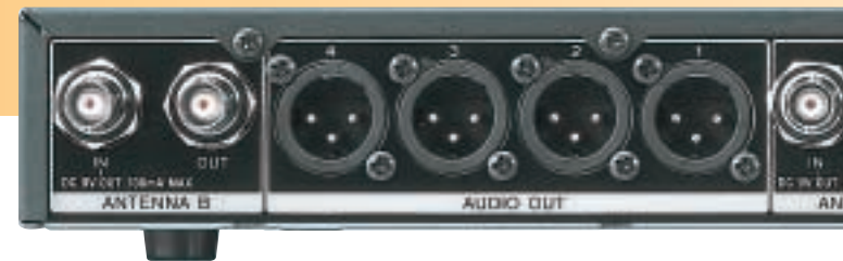
MB-8N Rear panel

Through a simple drag-and-drop operation, the operator can designate the channels to appear on the right side for access to an extensive range of operating controls and information which includes the channel name, selected channel group/frequency, tone squelch status, noise squelch status, RF squelch level, AF/RF input levels and transmitters battery alarm. The AF level is indicated in steps of approximately 2.5 dB, while the RF level is indicated in steps of approximately 5 dB. The GUI also allows the control of all other settings available on the MB-8N Base Unit.