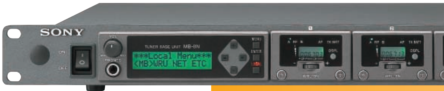
MB-8N/WRU-8N Front panel

The MB-8N Tuner Base Unit houses up to four WRU-8N UHF synthesized tuner units in its 1U high, 19-inch rack mountable design. This allows users to flexibly expand the number of wireless channels in a system according to their budgetary and operational needs. The compact design of the base unit makes it easy to install in both fixed and mobile applications.