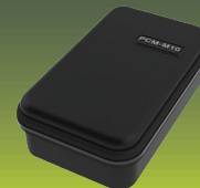
LC-PCMM10G Carrying Case