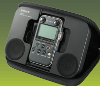
CKS-M10 Carrying Case Speaker