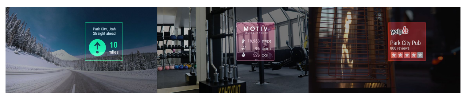
Heads-up navigation info